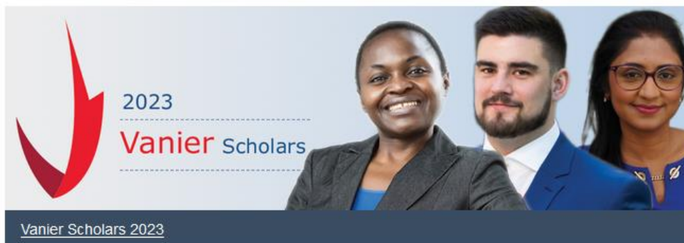
Vanier Scholars 2023