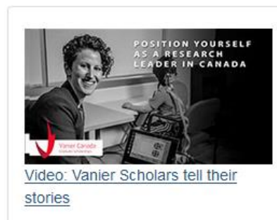
Video: Vanier Scholars tell their stories