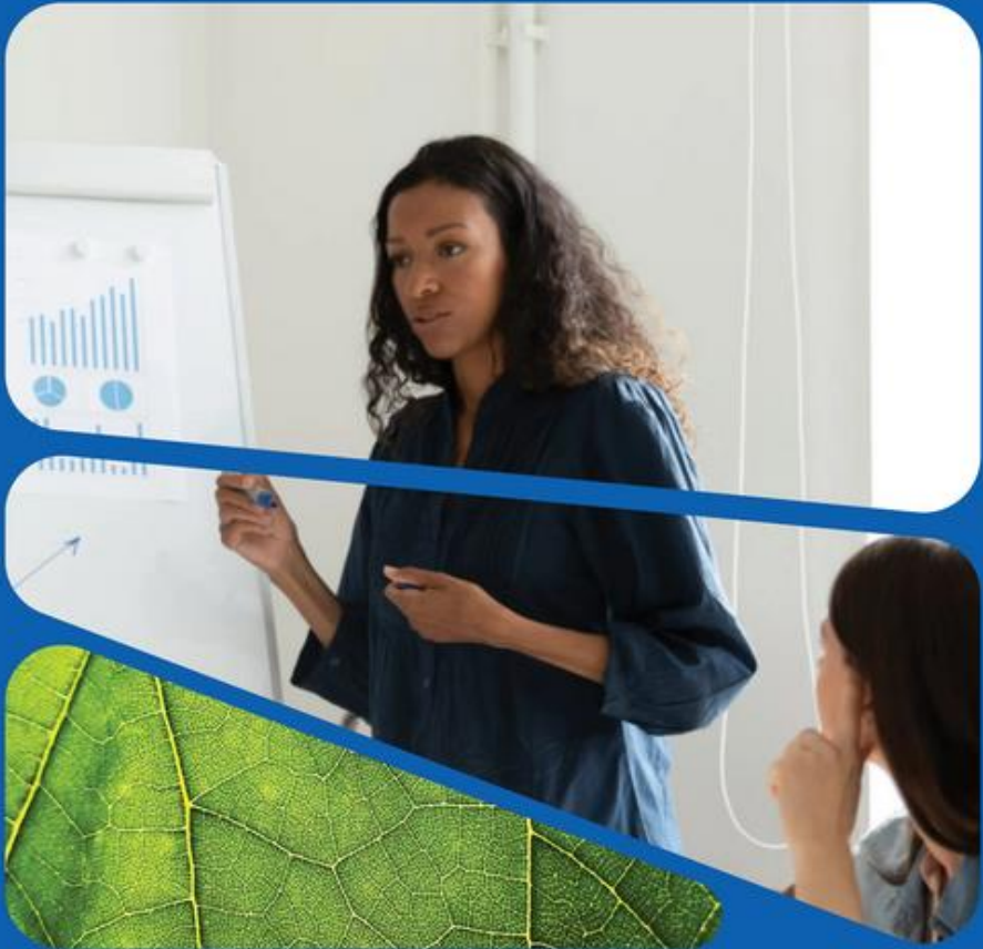
(Photo linked to webpage)